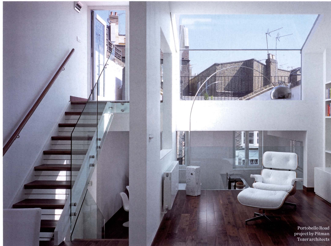
Portobello Road project by Pitman Tozer architects

We asked the UK's top architects, 'If you could do one thing to add more light and space to property what would it be and why? Here are their creative, clever and inspirational responses